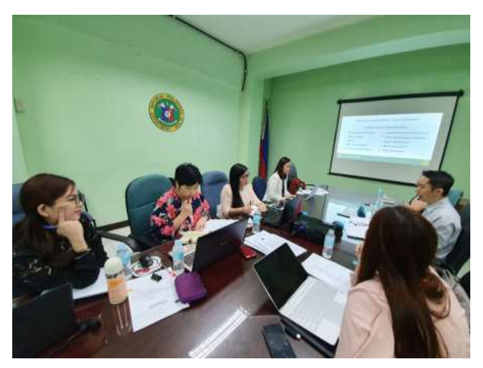
Discussing the process and method guidelines