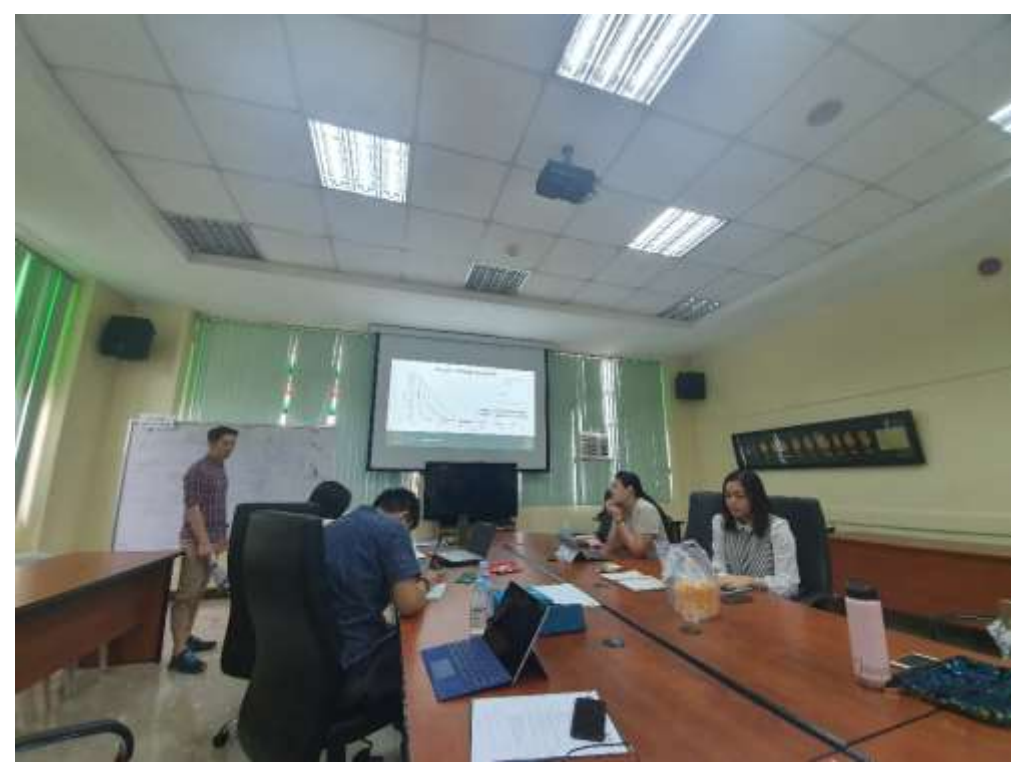
Discussing the results of the stakeholder consultation as well updates on the other studies