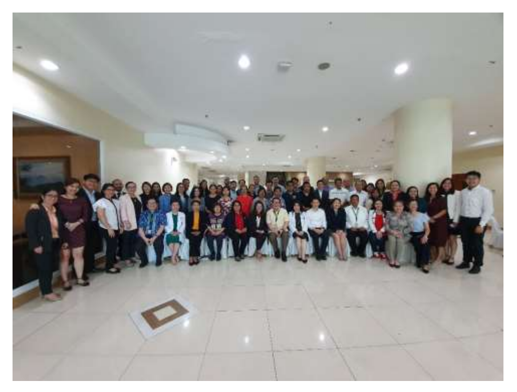
Philippine and HITAP partners after the RRT stakeholder consultation